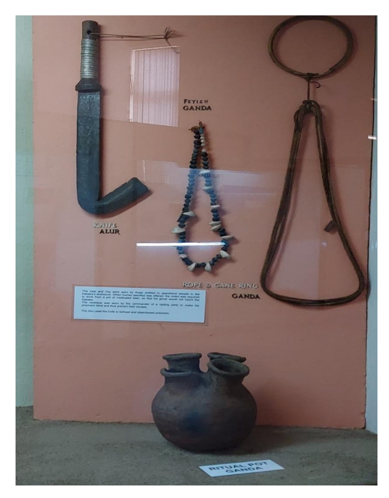
Figure 2: Assorted indigenous crafts of different tribes

The patrons and curators affirmed that their inspiration to establish museums emanates from their family background: