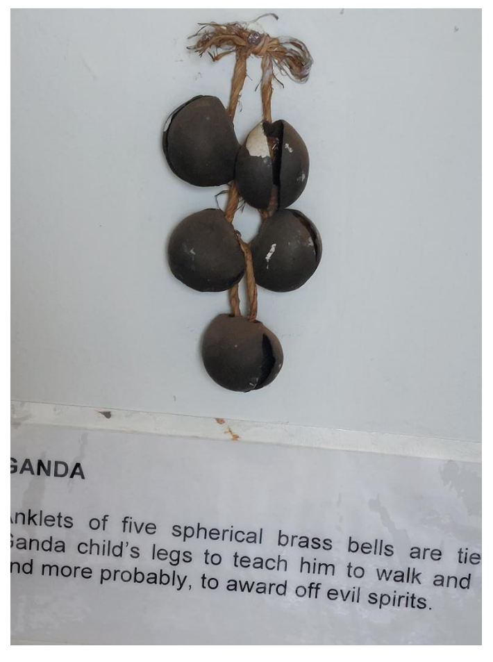
Figure 3: Endege (Rattles)

Data collected under this theme focused on how musealization centers extract information for documenting the lives behind collected artifacts. Whereas profiling information was still an important aspect considered as a part of musealia in some museums as displayed in figure 3, in other museums profiling was not made part of the musealia as observed in figure4.