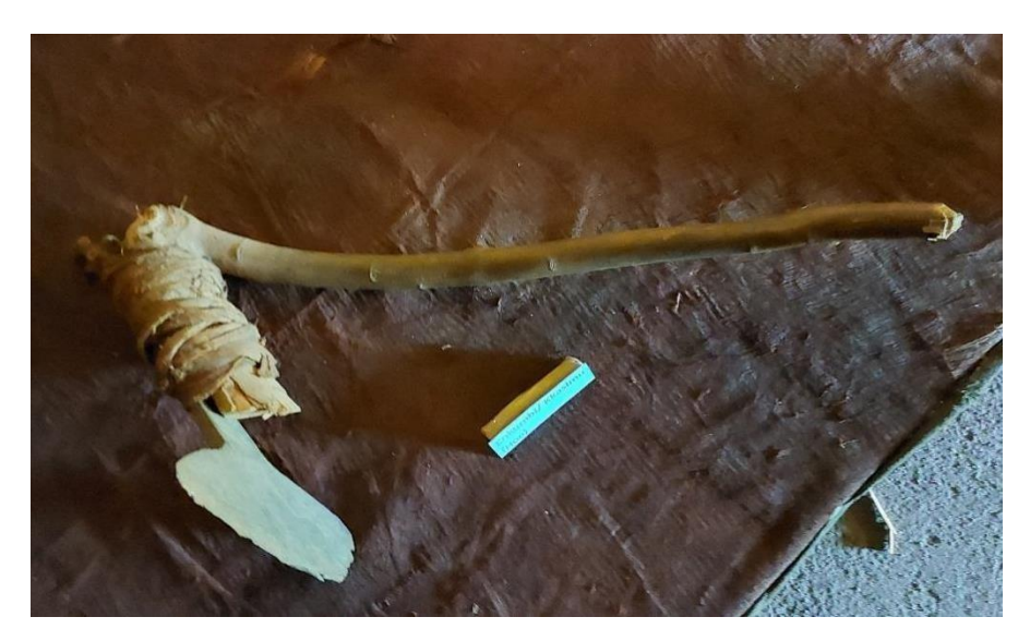
Figure 4: Iron hoe of the Baganda

In the modern era Musealization centers are obliged to serve as educational centers rather than just buildings for keeping scientific and artistic artifacts (Günay, B. (2012). With thoughtful reflective documentation and artifact preservation, a culture can be recorded and remembered regardless of its future. It makes the profiling of displayed musealia to be easily shared and understood by those from different cultural backgrounds (Yasmin et al, 2017; Trunfio, et al, 2020; Conti, et al, 2017). Profiling directs and describes what is displayed for visitors to the musealization center this is in reference to figure 5.