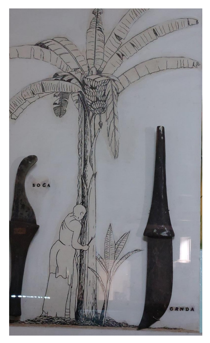
Figure 5: Iron Knives from Buganda and Busoga

The following response reflects what the interviewees replied when asked about their profiling of collected indigenous iron artifacts.